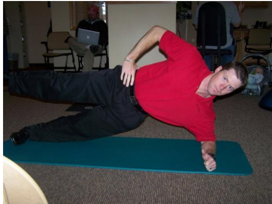
#6 Side Plank with Hip Abduction