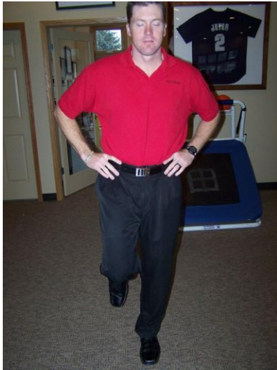
#1 Single Leg Balance with Eyes Closed