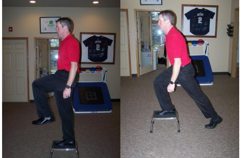
#2 Stair Step Up / Step Back