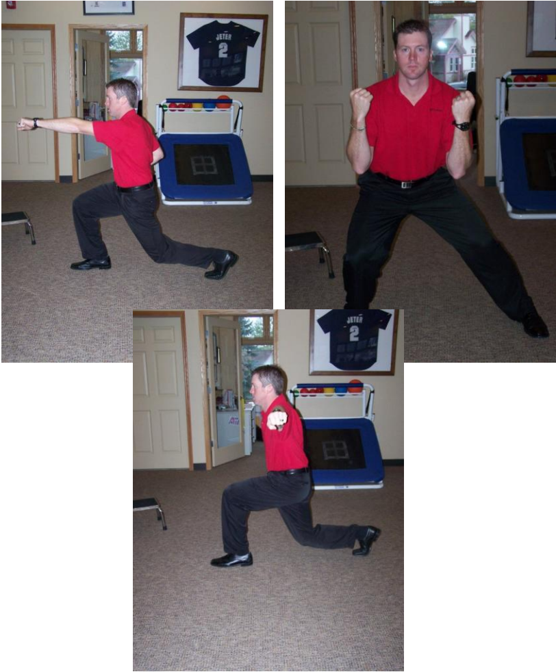
#7 Lunge Matrix (4-way)