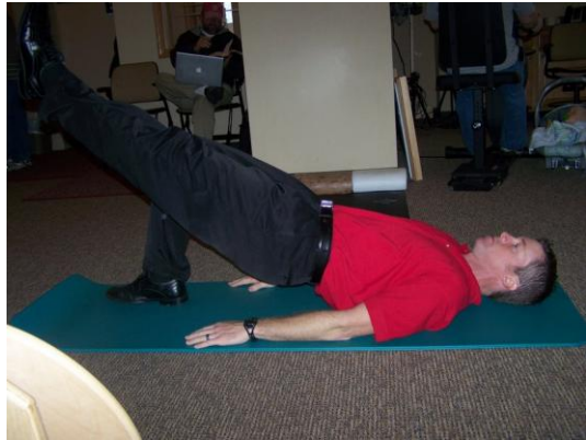
#5 Bridge with Knee Extension